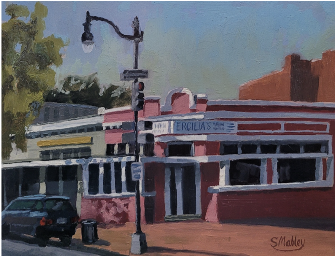
Ercilia's