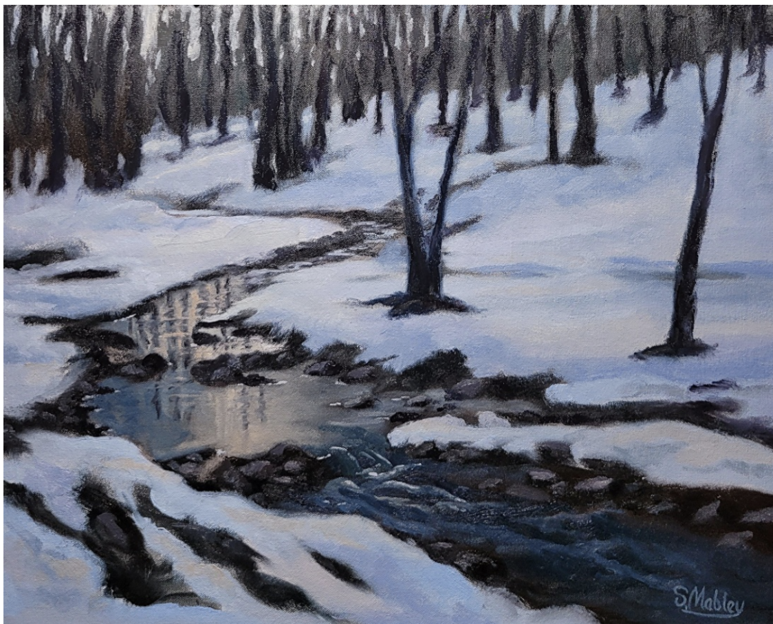
South Fork Indian Run