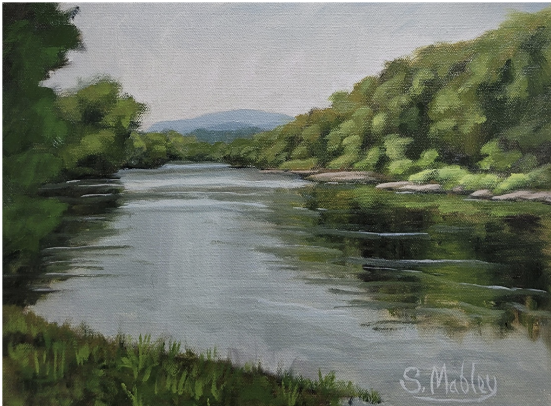
Potomac at Hancock