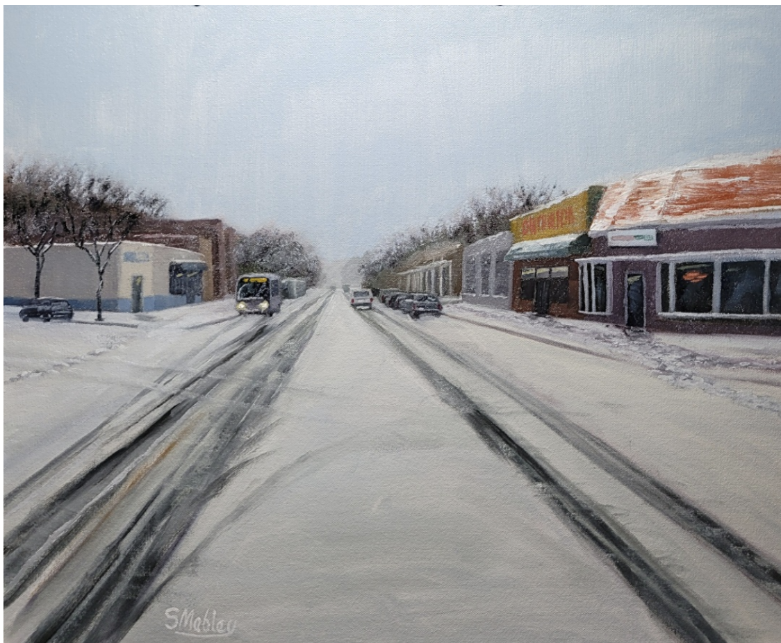
A White Mt. Pleasant